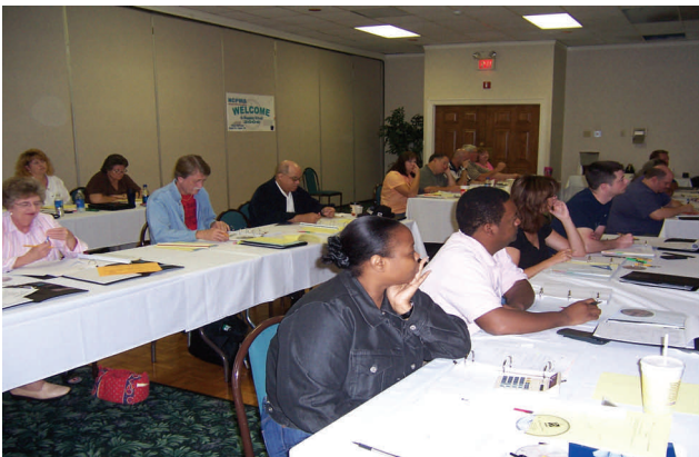
BELOW: Advance class students learn curves.