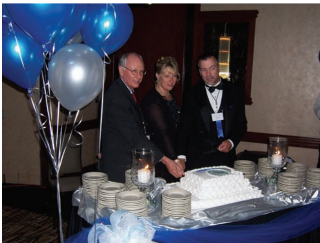
ABOVE: Awards Banquet cake cutting ceremony at the 2005 NCPMA Fall Conference